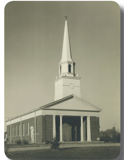
Lutheran Church of the Redeemer-1942