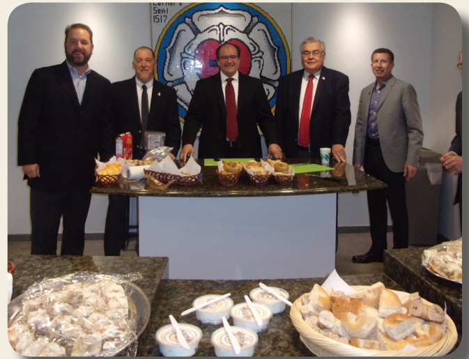
Board of Elders serving coffee